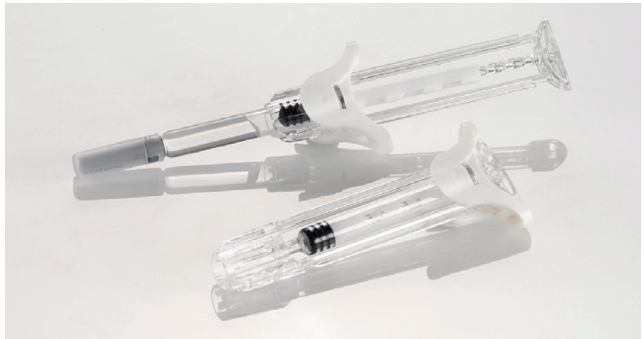
Figure 1: Unisafe™, the springless, passive safety device designed to work with existing, prefilled syringes, avoids disruption to an end-user's treatment routine whilst ensuring that there is no need to change any existing injection components.

The current market place is largely composed of retractable and non-retractable safety syringes which are activated through a spring component. This has previously led to challenges, including accidental activation where a device may activate in transit or accidental under-dosing, where it